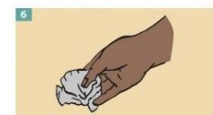
6 Dispose of the gloves safely. Do not reuse the gloves.