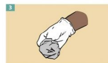
3 Hold the glove you just removed in your gloved hand.