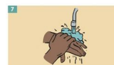
7 Clean your hands immediately after removing gloves.