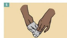
5 Turn the second glove inside out while pulling it away from your body, leaving the first glove inside the second.